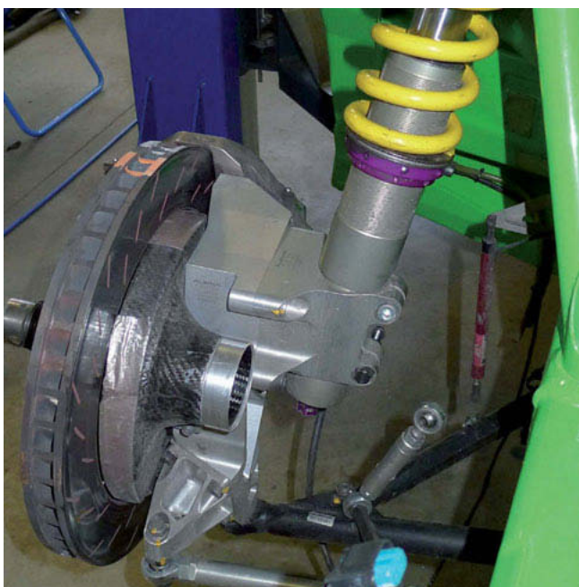
The suspension strut clamp installed in a BMW ALPINA B6 GT3.

Without a doubt, this list also needs to include OPEN MIND's feature and macro technology, which enables the user to standardise and automate the programming of geometries. Including intelligent macros, Customized Process Features (CPFs), and the option of connecting proprietary programs to hyperMILL ® via an API.