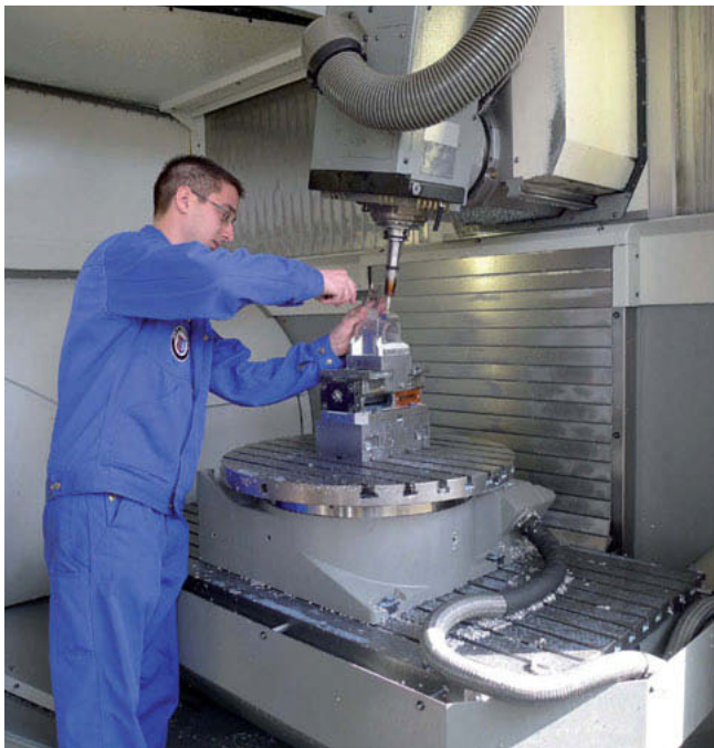
The suspension strut clamp on the 5-axis machining centre from DMG.