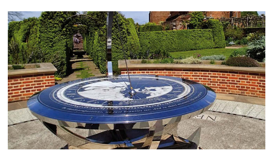
Ramco handles a wide variety of projects, including artistic sundials.

Making the mounting brackets required machining Invar, a nickel-iron alloy with a low thermal expansion coefficient, allowing it to meet the rigors of launch and enabling it to compensate for the extreme temperature swings of outer space. The mounting bracket has exceedingly tight tolerances. The central rib's thickness is .050" +/- .001", perpendicularity between surfaces is held to .001" and the bracket's two opposing surfaces must be in-line with each other to within .001".