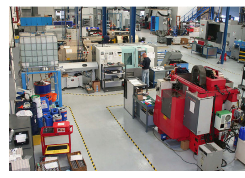
Long&Marshall Machine Shop